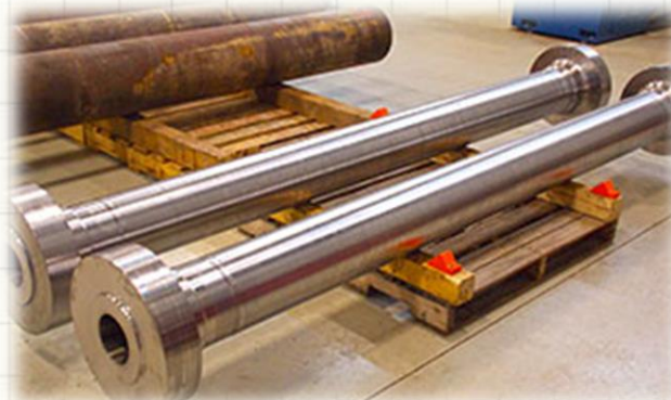
GENERAL MACHINING PINS & BUSHES