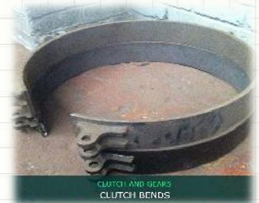
CLUTCH AND GEARS CLUTCH BANDS