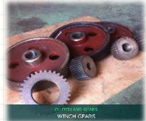
CLUTCH AND GEARS WINCH GEARS