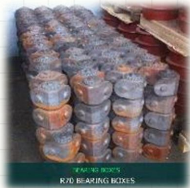
BEARING BOXES R/D BEARING BOXES

All Types of Winch Gears, Buffers, Trunnions, Flanges, Bearing Boxes, Clutch Bends & Variety of Municipal wheel binds etc.