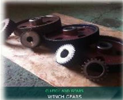
CLUTCH AND GEARS WINCH GEARS