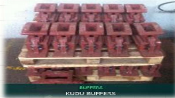
BUFFERS KUDU BUFFERS